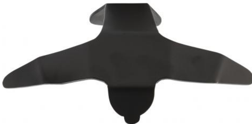
1 HOOK UP BLACK