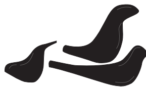
pájaros set of 3 decorative birds black