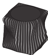
pot cover black

DIMENSIONS H 145 - mm W 190 - mm D 190 - mm